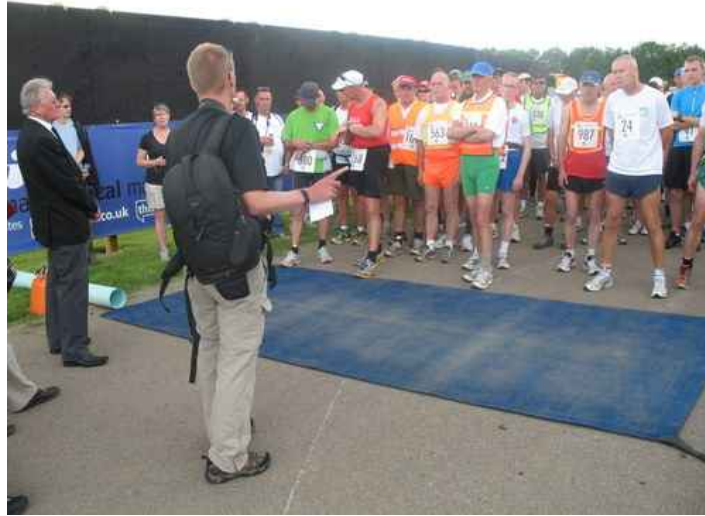
The start line of the Lingfield 100

As per usual the Dutch were in Lingfield in style! Big kitchen and support staff, their own timing clock and everyone with personalised T- shirts! And, as per usual, there was such great camaraderie between the Dutch walkers and the English!